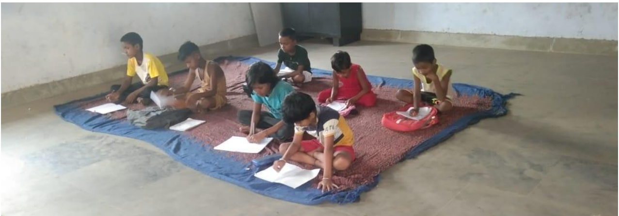
5. Regular Classes at Sankalp Vidyalaya, Kalahandi, Orissa