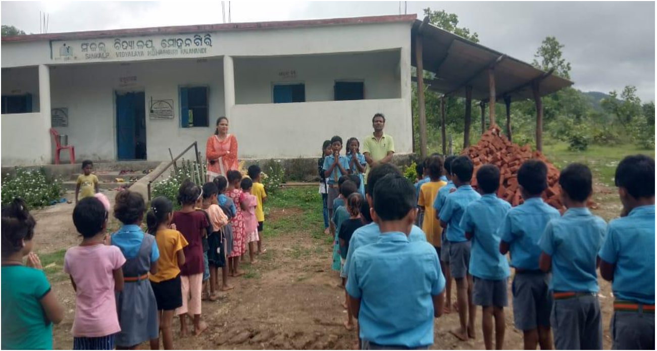
6. Regular Classes at Kalahandi, Orissa Centre 1